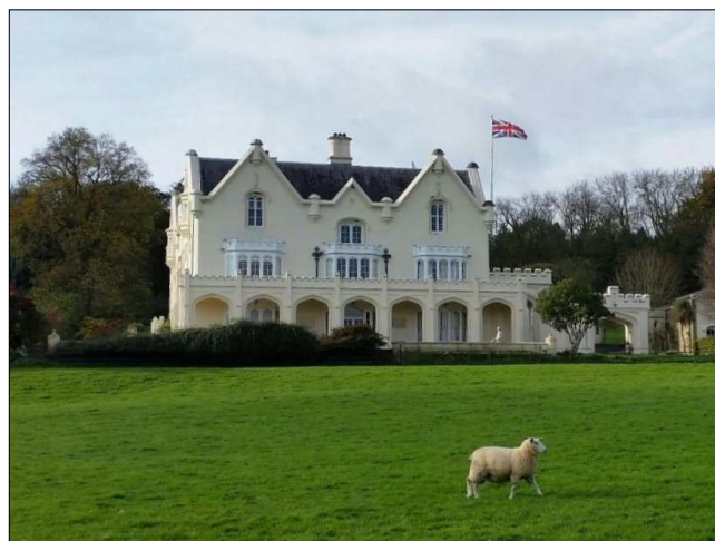
Pelham Place, Newton Valence